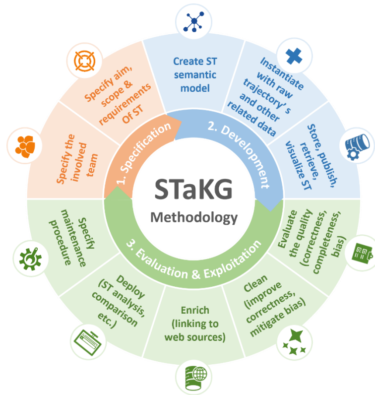
Figure 1. Phases and processes of STaKG methodology.

The three phases of the STaKG methodology are briefly described below (and depicted in Figure 1):