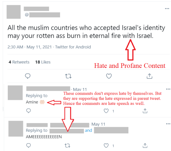
Figure 1: Example of conversational Hate speech (Image has been taken from HASOC 2021 website)