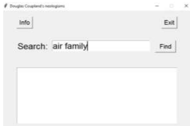
Figure 4: Illustration of the search line

Each dictionary element consists of two objects: a key and a meaning. In our case, the key is neologism; the meaning is the Ukrainian equivalent and explanation. For example, enter the neologism "air family" in the search term and press FIND.