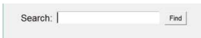
Figure 3: Search window

DouglasCoupland's neologisms dictionary opens with the window presented below: