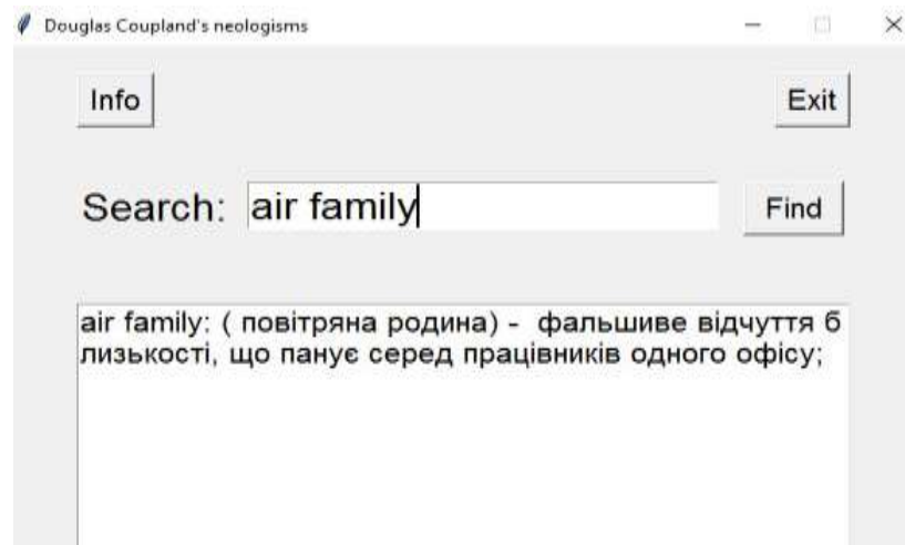
Figure 5: Option of find

Each dictionary element consists of two objects: a key and a meaning. In our case, the key is neologism; the meaning is the Ukrainian equivalent and explanation. For example, enter the neologism "air family" in the search term and press FIND.