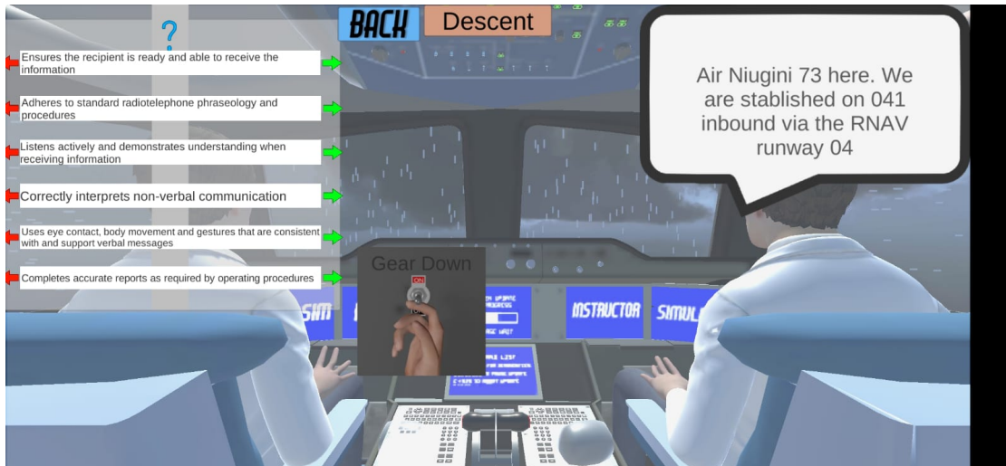
Figure 1: FI-SIM in-game footage, showing virtual pilots in action and possible OBs that can be identified by the player.