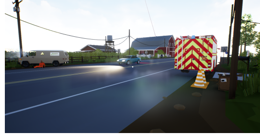
Figure 2: Assessment scenario