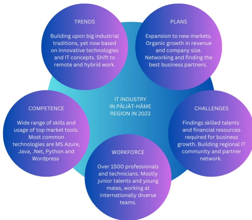
Figure 2: Overview of Software & IT Industry in Päijät-Häme region in 2023.

reputation, and resource availability also pose obstacles to growth. Gender equality in the IT community needs attention, and there are recruitment challenges concerning specialized skills and business acumen. While our study provides practical insights, it has limitations. The findings are based on a specific subset of companies and may not fully represent the entire industry. A larger sample and periodic studies could offer a more comprehensive view. Despite these limitations, the identified support needs among companies emphasize the importance of technological advancements, collaboration, research, customer insights, talent acquisition, and development efforts. Community avenues, including startup assistance, educational collaborations, global marketing, and tailored training programs, are vital for fostering growth in the IT sector. By addressing challenges and embracing opportunities, Lahti's IT industry can contribute to regional growth, economic progress, and overall prosperity.