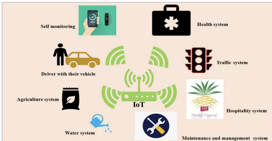
Figure 1: IOT based application for smart villages and cities.

The rest sections of the paper are organized as follows. Section 2 talks about core concept of smart village. Section 3 discussed about the role of IOT in agriculture. Section 4 presents