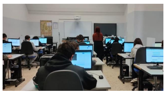
Figure 2: ROLLING-MINDS! at school.