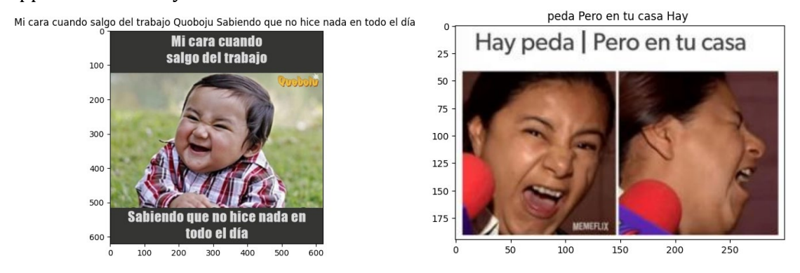
Figure 1 . Two images are shown in the figure. In the left image, the extracted text includes a username. In the image on the right, the extracted text is not in the original order.

These conclusions do not seek to generalize the data present in the dataset but rather tell us about particularities observed in the dataset, which could affect the training of the models and which, if solved, could lead to better results. The following sections describe the approaches used by the research team to address these issues.