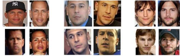
Figure 1: CFP dataset example images of individuals

CFP dataset examples are shown below in Fig. 1: 4 random face images for each of the 3 individuals from the dataset.