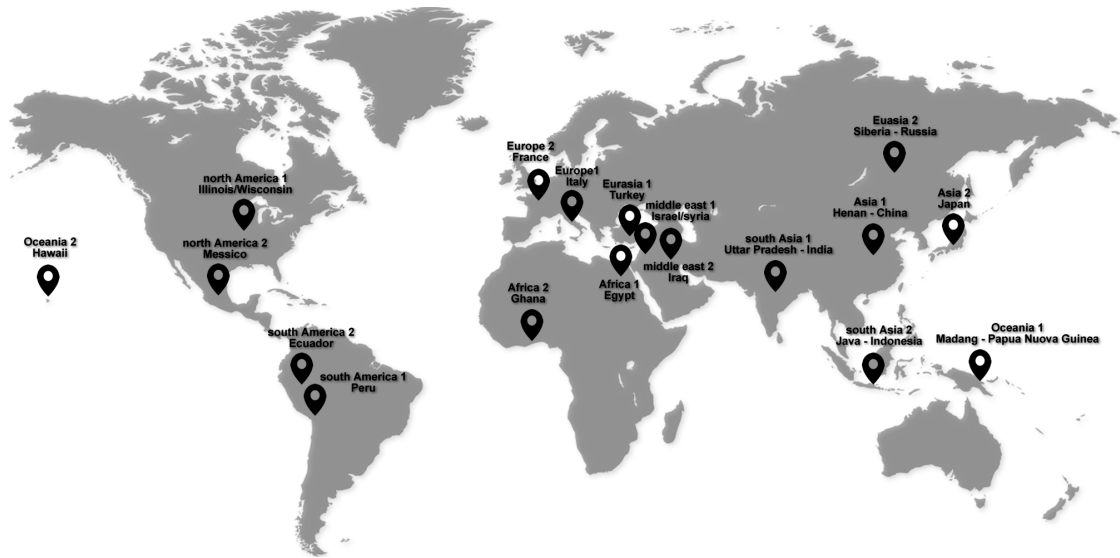
Figure 2: Distribution of the sampling zones. There are two sampling zone per World region: North America (US, Mexico), Oceania (Hawaii, Madang - Papua New Guinea), South America (Ecuador, Peru), Europe (France, Italy), Africa (Egypt, Ghana), Middle East (Levant, Iraq), Eurasia (Turkey, Siberia), South Asia (Uttar Pradesh - India, Java - Indonesia), East Asia (Henan - China, Japan)

tative and structured or semi-structured data about the evolution of societies, defined as political units (polities) from 35 sampling points across the globe in a time window from roughly 10000 BC to 1900 CE, sampled with a time-step of 100 years. A sampling frequency of 100 years is too much coarse-grained, not suitable to track the internal phases of the secular cycle, thus we resampled the data with a sampling frequency to 10 years, manually integrating data and descriptions from Seshat and from Wikipedia. To do so, we followed these general guidelines: