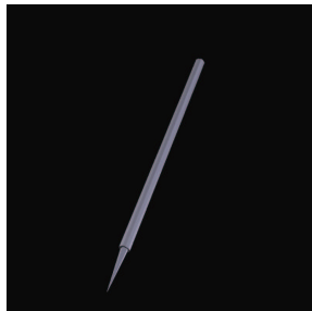
Fig. 1. 3D Model of needle