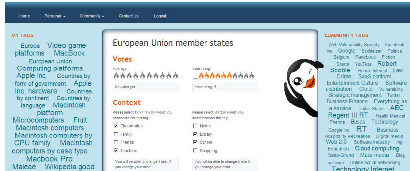
Fig. 2. Interaction Profile Declaration Tool

experience and reduce the knowledge latency in the class, which we define as the delay between the encoding of the knowledge of a professor on a specific subject into information (e.g. a lecture or slides) and the assimilation of this information as knowledge by students.