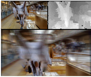
Figure 2 - Five-views synthesis from video and depth