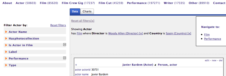
Fig. 2. Capture showing the pivoting enhancements: breadcrumbs as natural language in the middle, pivot-able facets with arrow icon and Navigate to box with pivoting options

The aim of the test presented in this section was mainly to validate that the introduction of pivoting solves the problems highlighted in the previous evaluation, described in Section 3.1. Six users that were not involved in the previous evaluation rounds were recruited and one of the tasks, Task 2, was identical to one of the tasks used in previous rounds.