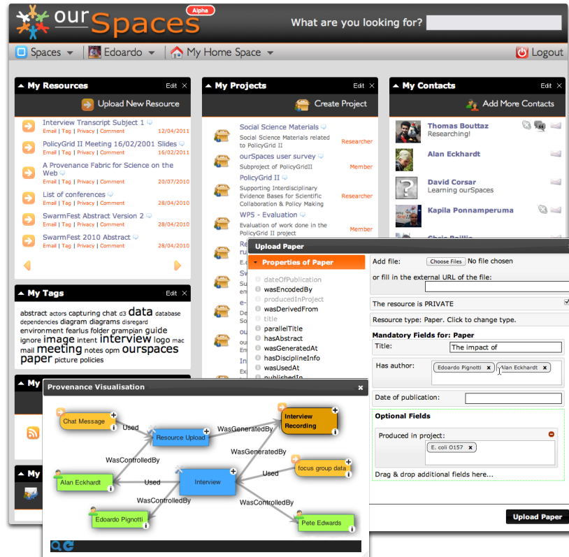
Fig. 1. A screenshot of the ourSpaces VRE showing a user's home space, an open upload form and the graphical provenance visualiser.

SPIN-based 5 reasoner to support the following system functionalities: representing and tracking the provenance of digital artefacts and processes; capturing the provenance associated with a user's social network; managing policies associated with use and re-use of data, security and privacy; controlling the behaviour of services within the application using policy-based reasoning; visualising provenance information using different modalities (natural language or graphical).