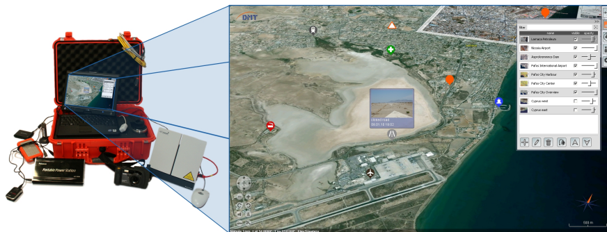
Fig. 1. DMT hardware and user interface.

vast amounts of information and cognitive resources from crowdsourcing and social networks, we are also concerned that exactly these assets are likely to be affected and potentially unavailable in disaster situations. Hence, our research focusses on how to use these technologies without critically relying on them. In previous work we have investigated the specific requirements for a tool to assist disaster management [5]. In the following paper we report on our work towards a software prototype that helps to study how experts use such a tool under field conditions. We briefly describe the application domain the system is intended to be used in. We describe the functionality and the system architecture of the DMT. Finally, we present and discuss evaluation feedback of users who worked with the DMT during several training missions.