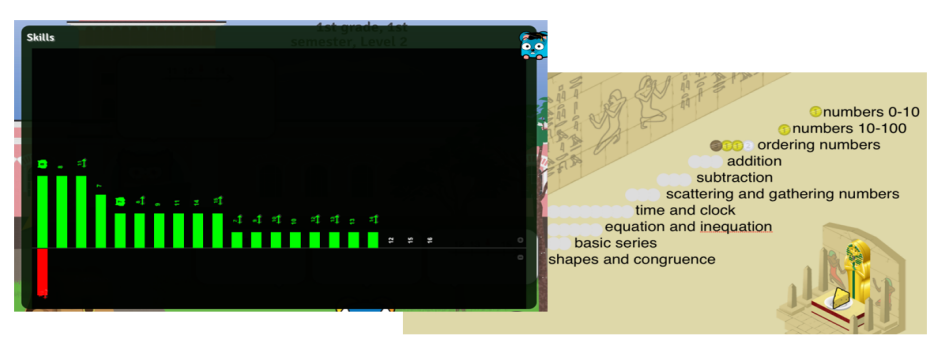
Figure 2. In-game learning analytics in Eedu Elements game.

In-game learning analytics are meant for parents and teachers to quickly observe what learner has taught for his/her game character. The visualisation (figure 2, left) shows correctly taught concepts in selected level with green bars that are that higher what better learner knows the concept. Wrongly understood concepts are show with red bars at the bottom of the screen. The general year-based diagnostics (figure 2, right) shows the performance in upper level themes.