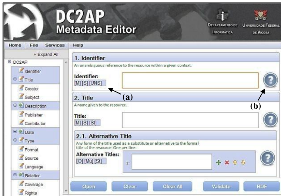
Fig. 2. DC2AP Metadata Editor

Fig. 2 shows the initial window of the DC2AP Metadata Editor. This tool is hosted on a server that provides access to its facilities and Web Services. It can be accessed by the URI: www.purl.org/dc2ap/editor .