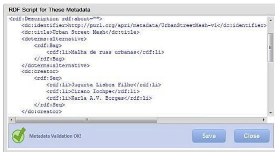
Fig. 3. Script RDF for the analysis pattern Urban Street Mesh.

To create the URI present in the RDF files generated by the DC2AP Metadata Editor, this tool has been integrated into the PURL toolkit [17], which is an environment for creating permanent identifiers for documents on the Web.