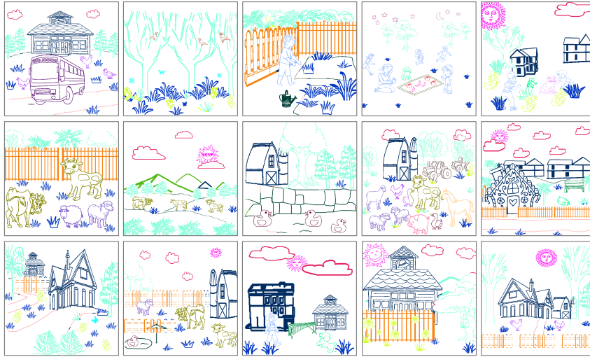
Fig. 2. Examples of good segmentation results.