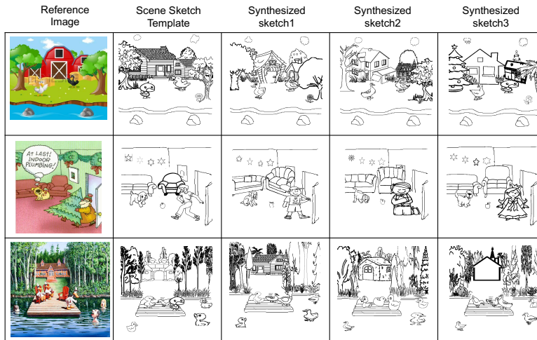
Fig. 1. Examples of augmented scene sketches based on the scene sketch templates.

As explained in Section 3 of our main paper, we augmented the dataset by replacing the object sketch with the rest components from the same category based on a given scene sketch template. As shown in Fig. 1, given the scene sketch templates in the second column, we further generated another 20 sketches and selected 3 among them. Column 3 to 5 show the newly synthesised scene sketches.