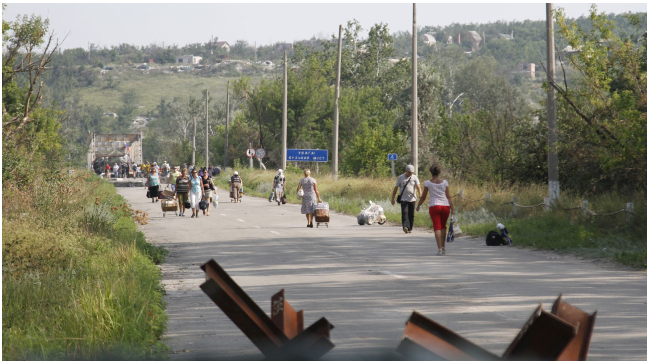
EECP Stanitsa Luhanska, the road to the bridge, the repair of which is blocked by representatives of the ORDLO