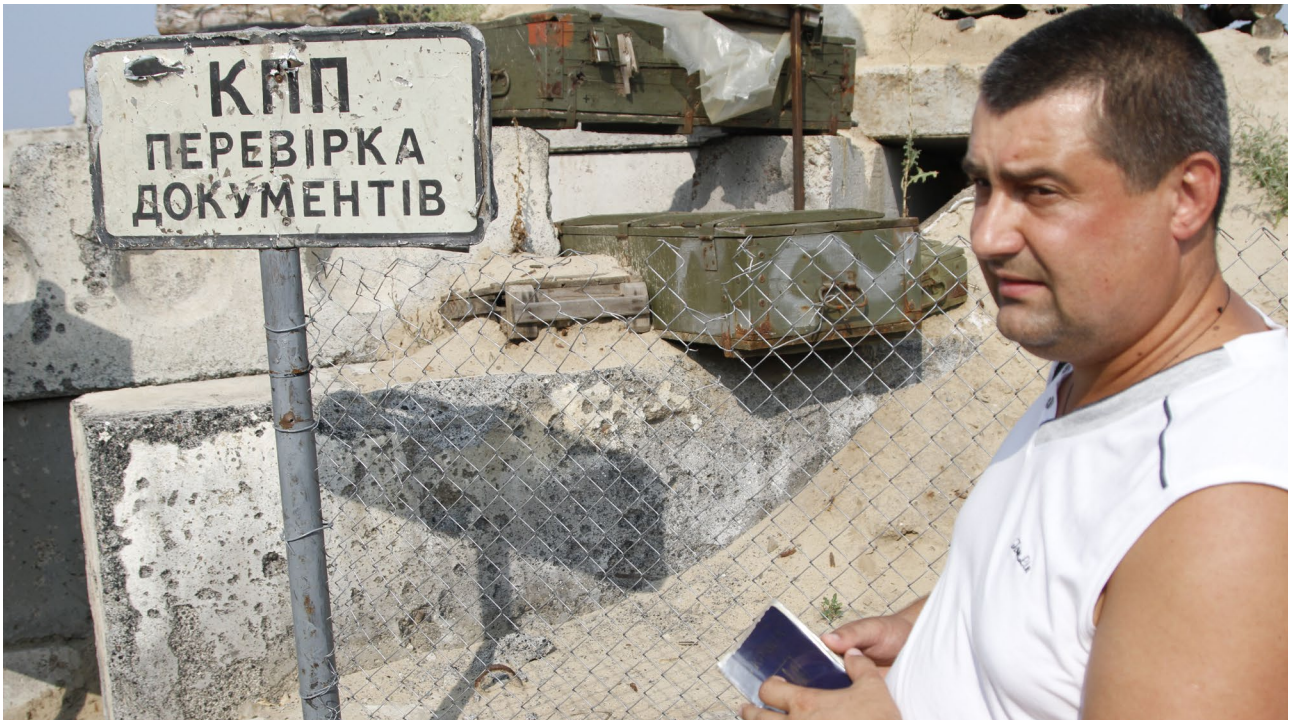
EECP Stanitsa Luhanska

On January 18, 2018, the Verkhovna Rada approved a draft law on de-occupation of Donbas which referred to Russia as an aggressor and occupant country. Then, on April 30, 2018, President of Ukraine and Armed Forces Supreme Commander Petro Poroshenko signed the Decree "On launching the operation of Joint Forces to ensure national security and defense and to rebuff and deter armed aggression of the Russian Federation in Donetsk and Luhansk Regions." ATO therefore was effectively reformatted into the Joint Forces Operation (hereinafter JFO), and command was transferred from the Security Service of Ukraine (SSU) to the Joint Operational Headquarters of the Ukrainian Armed Forces. But this has no consequences for the definition of the status of detainees. They have not received defined by law status which would allow application of IHL standards and practice for their protection.