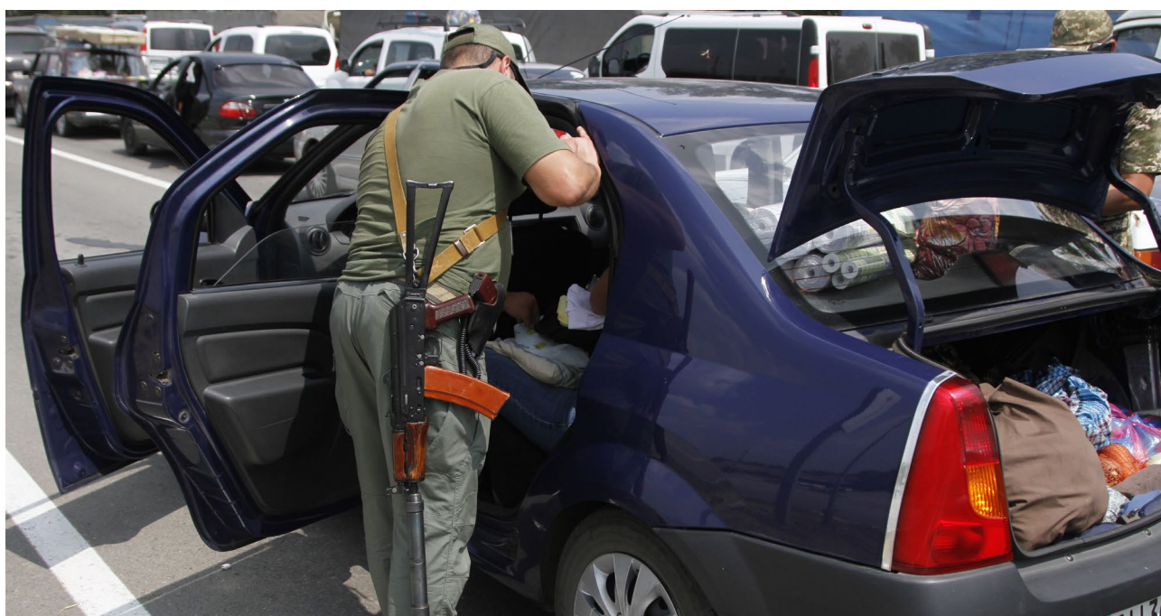
Security check at the EECP Novotroitske