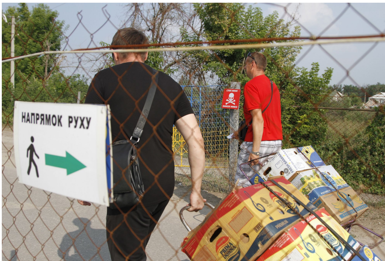
Entry-exit checkpoint point (EECP) Stanitsa Luhanska

In addition to providing an overview of the situation with unlawful detentions in Donbas, this document offers a series of recommendations on what can be done to alleviate the detainees' plight in the current situation.