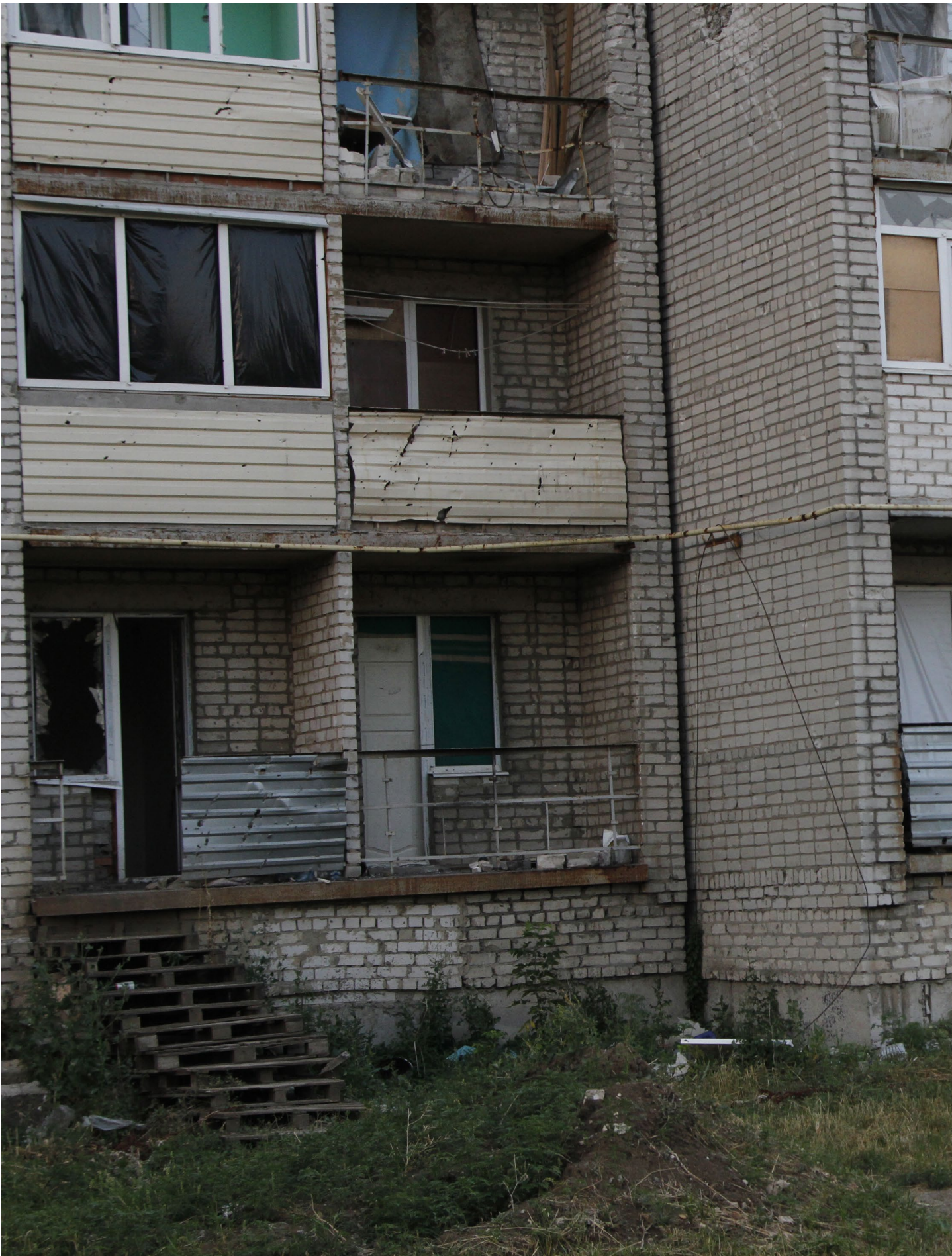
Houses in Avdiivka affected by the conflict