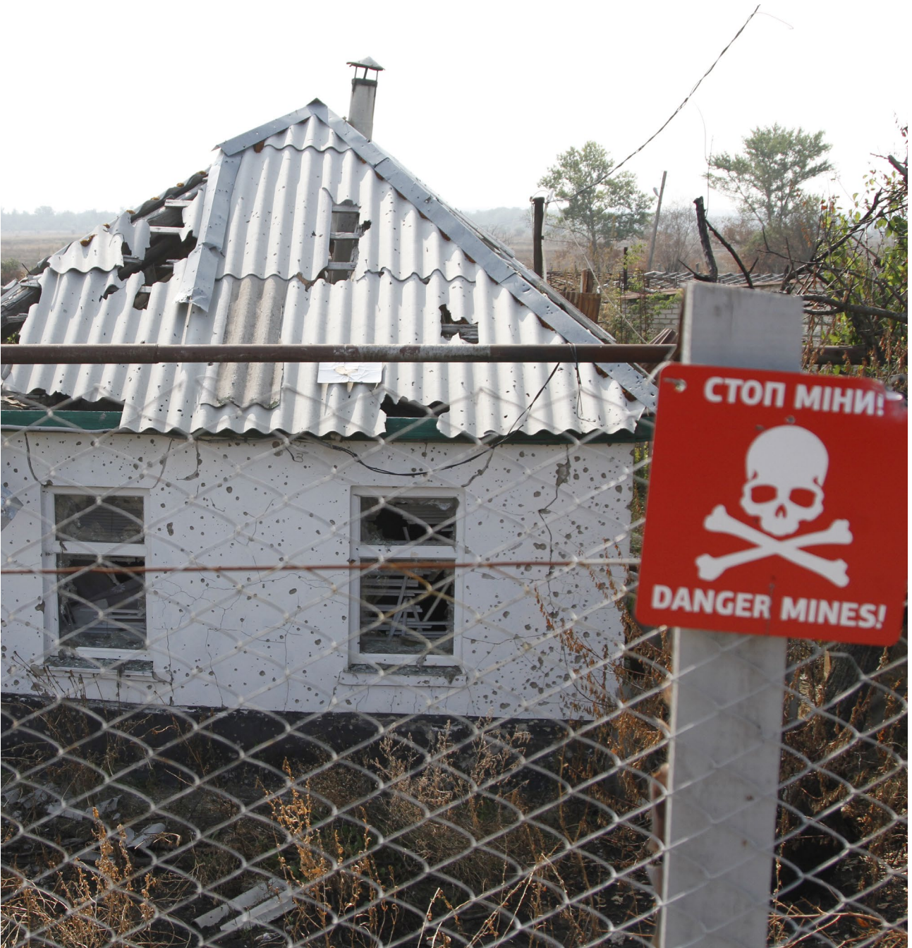
Along the road to EECF Stanitsa Luhanska