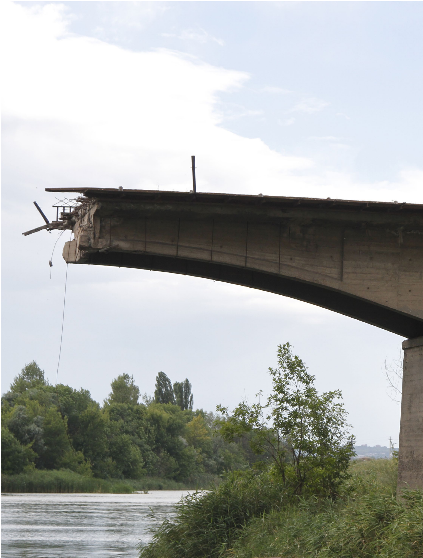
The bridge in Semenovka near Slavyansk (August 2016). Restored in December 2016