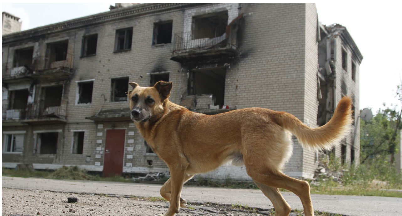
Houses in Mariinka

“Everyone ended up making a confession. It did not make sense to resist them. Being a hero would only result in serious injuries. Just describing what people had to go through makes one feel horrible. For example, one [militant] sits on a prisoner’s legs while another [militant] is hitting the soles of the prisoner’s bare feet with a police baton. This leaves you unable to walk. Some detainees were tortured with a stun gun. Do you know what is the most horrible sound at Izolyatsia? It’s the sound of duct tape being unwound. It means that they are about to tape someone’s