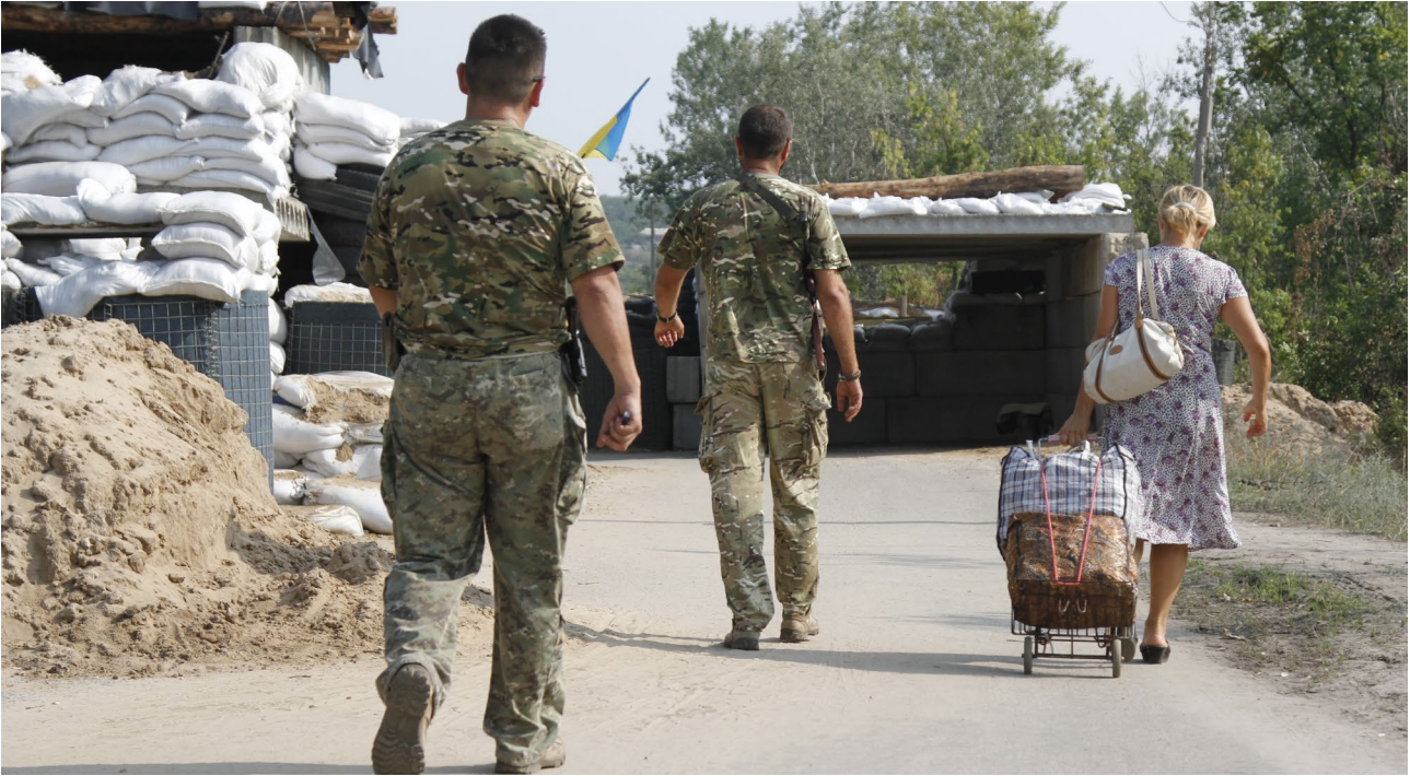
EECP Stanitsa Luhanska

wrists together and use electric shock on him. After that, we would hear the sounds of electric discharge and screams. They used it on their own men and on "spies." This abuse caused casualties." 9