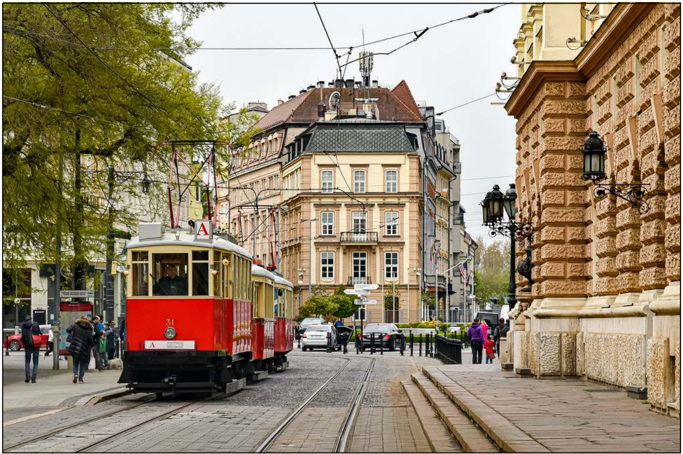
Bratislava