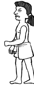
Figure 2. Enemy in angry mood

screen and can be animated: humans, locations, emotional tokens, etc. They are all images and can be modified by 'moods'.