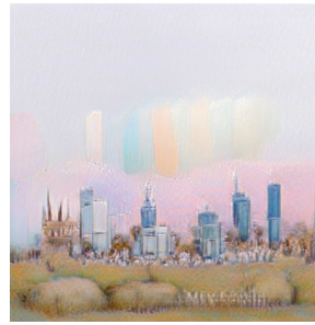
Figure 2: Image generated by the Big Sleep Colab notebook for the prompt “The Melbourne skyline in pastel colours”. Note the appropriate presentation of content and style, and additional pastel strokes in the sky as an unprompted innovation.

• In terms of pre-trained model selection , numerous people have substituted BigGAN with other GAN generators. This creative responsibility could be automated, with the system choosing from a database of GANs and installing new ones into the notebook.