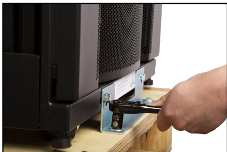
Removing the Bolts

Note: Make sure that at least one person is holding the Rack in place while removing the Pallet Brackets .