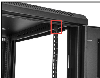
Removing the M6 Screw