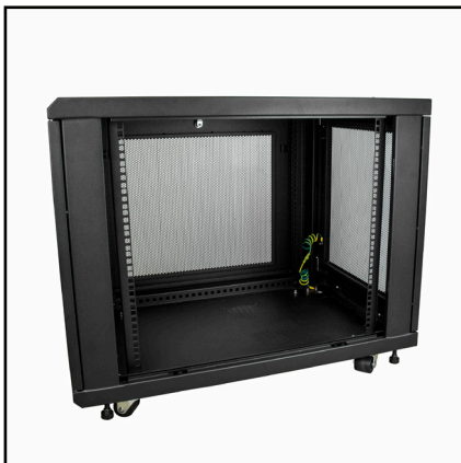
Side Panel Removed

Note: The bottom of the Side Panel is hooked onto a lip on the Rack Frame .