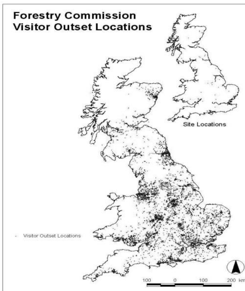
Figure 1. Visitor outset locations.

As far as reasonable we sought to allow the analysis to identify potential substitute and complementary attractions by including data on a wide array of sites and facilities ranging from highly similar alternative forests and woodlands, through other outdoor open access sites (including heathland, sandy beaches, other coastline, rivers, inland waterways and canals, scenic areas, and national parks) and built amenities (zoos and wildlife parks, theme parks, National Trust properties, and historic houses). Towns and cities were identified so as to provide a surrogate indicator for some of the attractions not directly measured (e.g., cinemas, shopping centers, sports centers, etc. ). A variety of data sources were employed in this undertaking (including the remote-sensed CEH UK Land Cover Database for 1990, Bartholomew's 1:250,000 Digital Database for Great Britain, the Scottish Council for National Parks, the (former) Countryside Commission for Scotland, internet sources (e.g., www.daysoutuk.com ), the International Zoo Yearbook [16] and the Good Zoo Guide [17]).