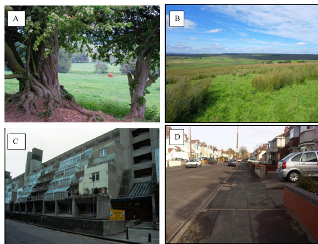
Figure 1. Examples of images used in the slideshows to depict scenes of nature environments (A and B) and scenes of built environments (C and D).

Scenes of Nature and Built Environments. The slideshows depicting scenes of nature and built environments involved still photographs representing each of the environments. The photographs were chosen from a central pool of photographs used within the research group. 15,16 The photographs (Figure 1) depicting natural environments included natural elements, e.g., trees, grass, or plant life, and were devoid of any man-made structures, e.g., buildings, vehicles, roads. In contrast, the photographs depicting built environments contained man-made structures, e.g., houses, flats, office