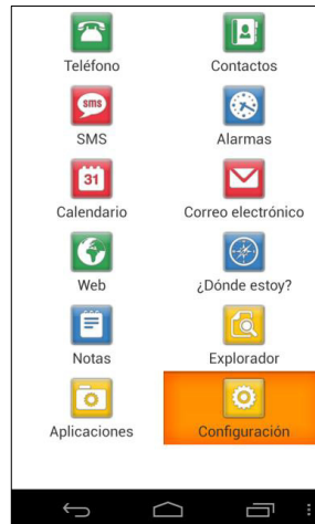
Figure 3 The Mobile Accessibility for Android Main Screen

This application focuses mainly on blind people however, it could be used to simplify the mobile interface for elderly people too. The analysis has been performed over the 2.05 version (first 30 days evaluation free). Its strengths are that this application provides its own voice service that speaks the content of the interface without the need of additional assistive technology. As a weakness, this voice service cannot be disabled so elderly people could reject it because the App could cause the user to feel different from other users [25]. In Figure 3, screenshot is showed.