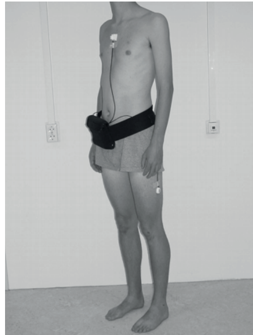
Fig. 1. Study participant showing configuration of the activity monitor, with accelerometers on the sternum and thighs.

Accelerometric data were acquired with the Vitaport AM. Three piezo-resistive ( 1.5 \times 1.5 \times 1 cm) accelerometers ADXL202 (Analog Devices, Breda, The Netherlands, adapted by Temec Instruments, Kerkrade, The Netherlands) were taped to the subject's skin. One was attached to the sternum, with the sensitive axis oriented into the sagittal, longitudinal and transverse directions, and 1 to each thigh, with the sensitive axis oriented in the sagittal direction while standing (Fig. 1). Acceleration data were stored on a Vitaport 2 recorder (sample frequency 128 Hz), transferred to a PC and analysed with the Kinematic Analysis Module of the Vitaport Analysis Package. This program automatically detects a large set of body postures, motions and transitions between postures, with a 1-s resolution (Activity Detection Time Series). Postures and motions with a duration < 5 s were disregarded (25). The monitor stored raw data, so, from the recorded files, the time-frame analysed (from 10.00 h to 18.00 h) could be checked precisely. The reliability and validity of the AM for mobility detection has been studied extensively (7–10, 26).