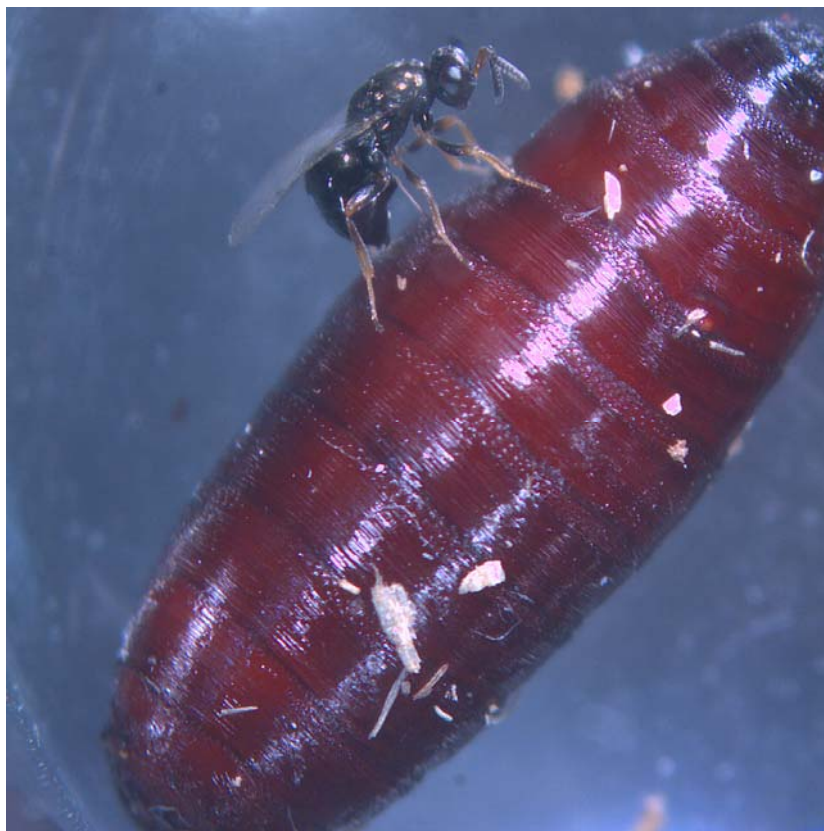
Figure 1. Female Nasonia vitripennis injecting venom into a pupa of the blowfly Calliphora vomitoria .

Adult females always inject venom prior to oviposition, and the envenomated fly never survives the attack. The venom is highly potent to a wide range of agriculturally important filth flies [1]. The wasp is also of medical importance, since it can be used in biological control of the common house fly, Musca domestica , a major vector of human disease. Furthermore, its venom is very toxic to multiple developmental stages of several mosquitoes that are vectors of such diseases as malaria, encephalitis, yellow fever and West Nile fever [2].