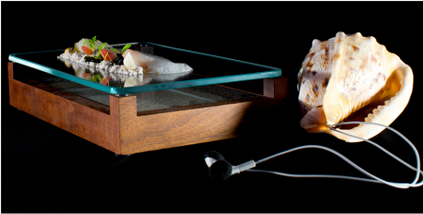
Figure 3. The ‘Sound of the sea’ seafood dish, as served at Heston Blumenthal’s The Fat Duck restaurant. The dish comes to the table with a pair of headphones hanging from a conch shell.

have a surprisingly large effect on our taste and flavour experiences. So, for example, Daniel Oberfeld and his colleagues in Germany found that white wine (tasted from black tasting glasses) was liked more when either red or blue, rather than white or green, ambient lighting was used in a winery on the Rhine. Subsequent laboratory experiments showed that participants rated a white Reisling as tasting significantly sweeter under red lighting than under green or white lighting. Not only that, but people said that they would be willing to pay significantly more for the wine tasted under red lighting than under white lighting. Elsewhere, researchers have reported that people who like strong coffee tend to drink more of it under brighter ambient illumination conditions, whereas those who prefer weaker coffee tend to drink more under dimmer illumination. Red-and-white table-cloths and Italian flags festooned on the walls, not to mention a dash of Pavarotti singing opera over the loudspeakers, can all impact on the perceived ethnicity of a dish too.