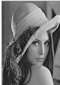
(a) Original image of Lena

10%, 35%, and 45% density impulse noises are respectively added to the original image of Lena. With VC++6.0, results of the comparative experiment are shown as Fig. 1.