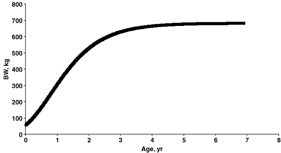
Figure 2. Visualization of the Gompertz curve describing the dynamics of BCS-corrected BW within the SimHerd model (see Table 3).