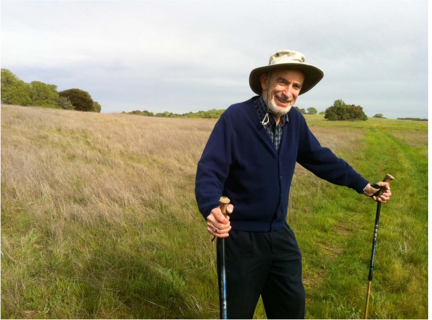
Paul Ehrlich on Jasper Ridge