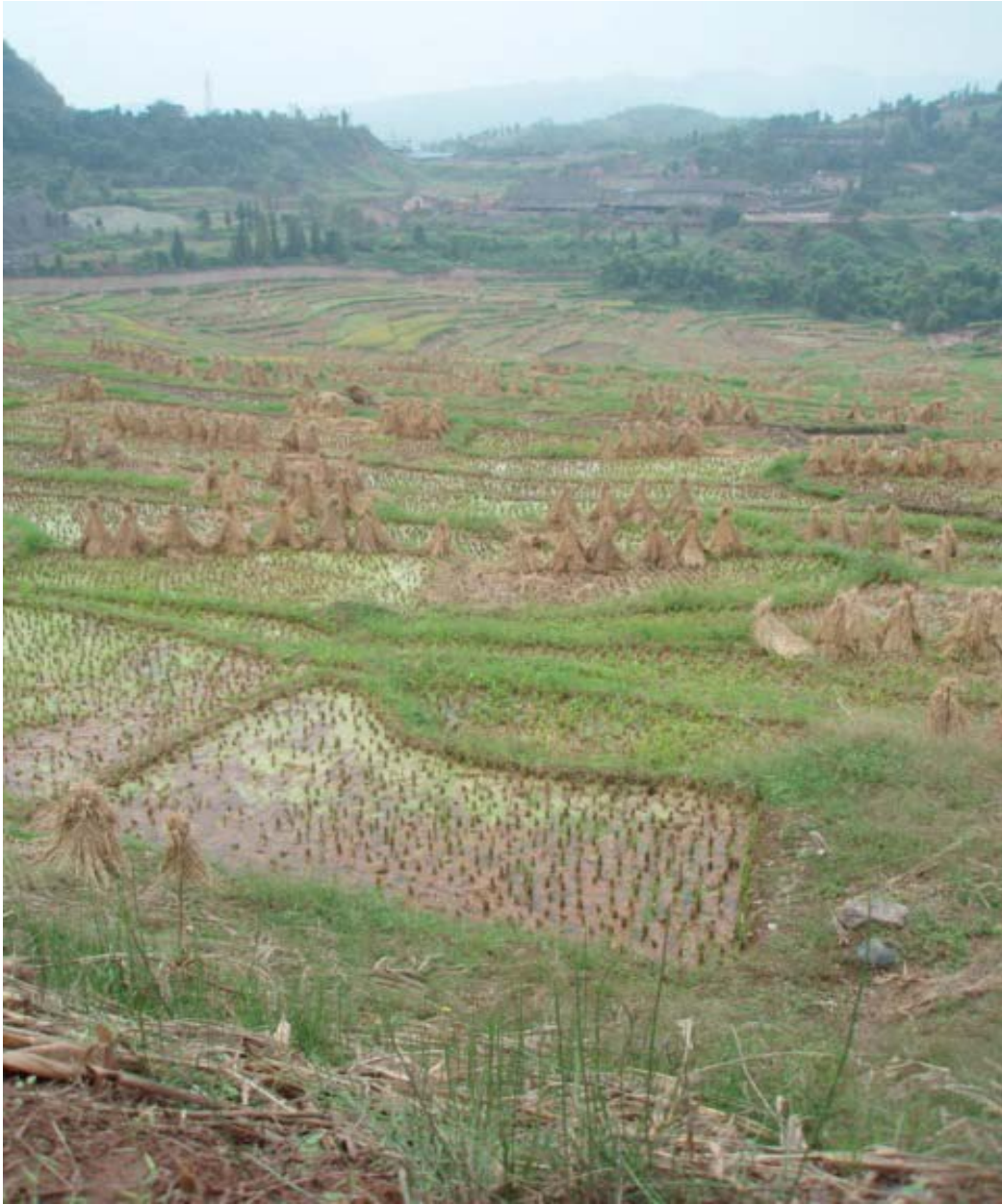
Fields, Baoxing County, Sichuan, China