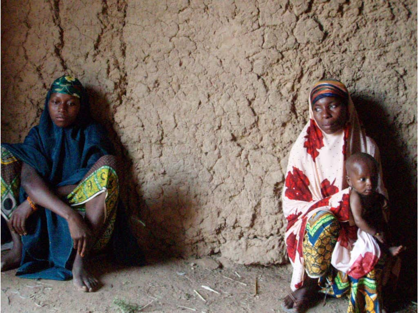
Chief's wives, Bargaja, Niger