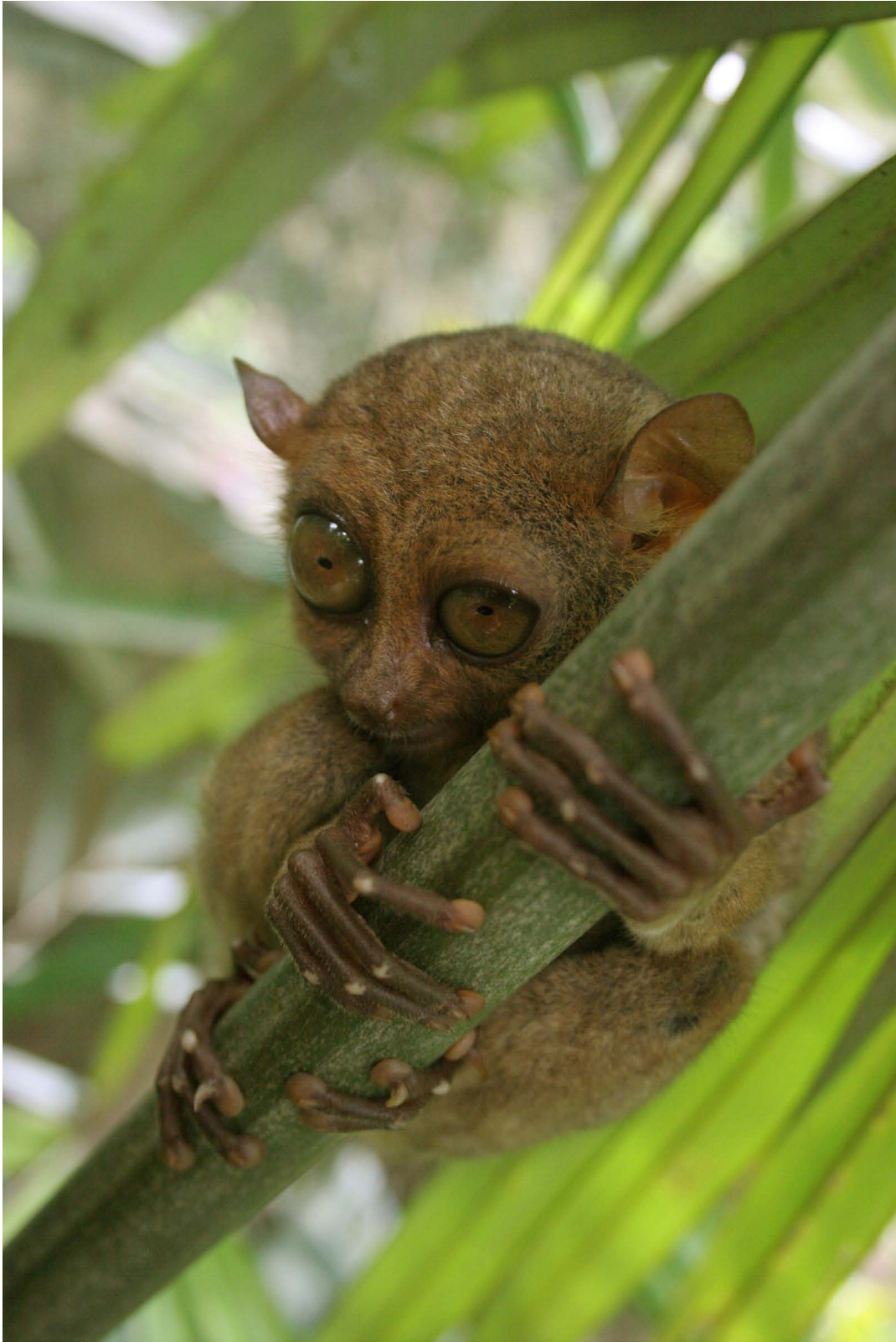
Tarsier, Bohol Island, Philippines