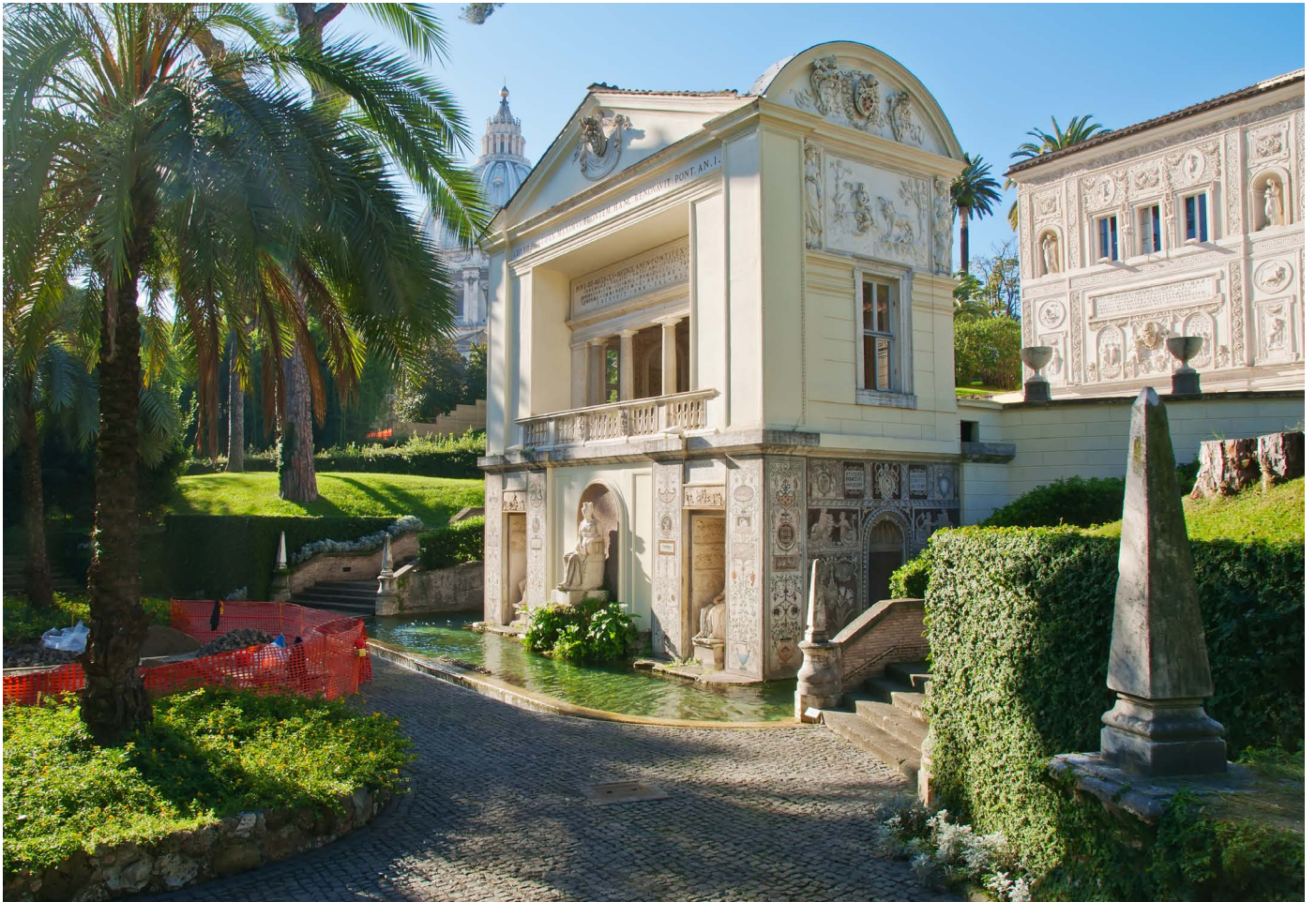
Casina Pio 4, Vatican