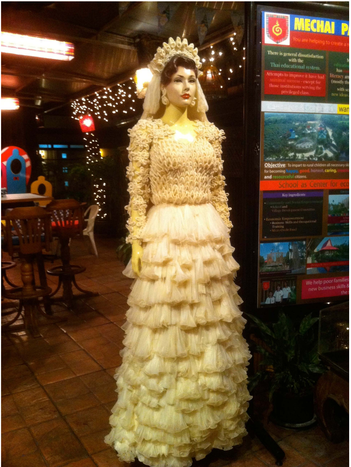
Cabbages & Condoms, Bangkok, Thailand