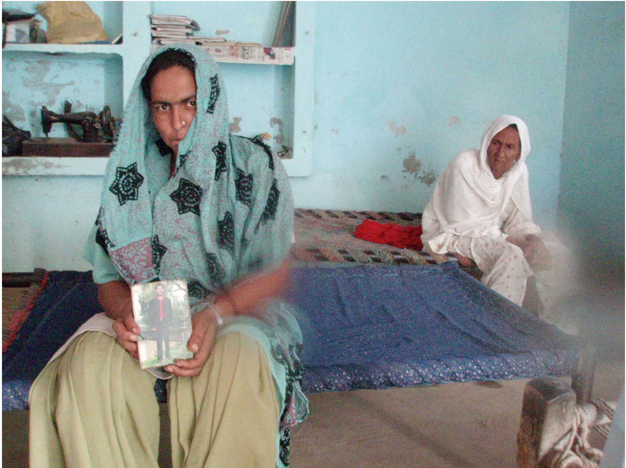
Suicide-by-pesticide widow, Punjab, India