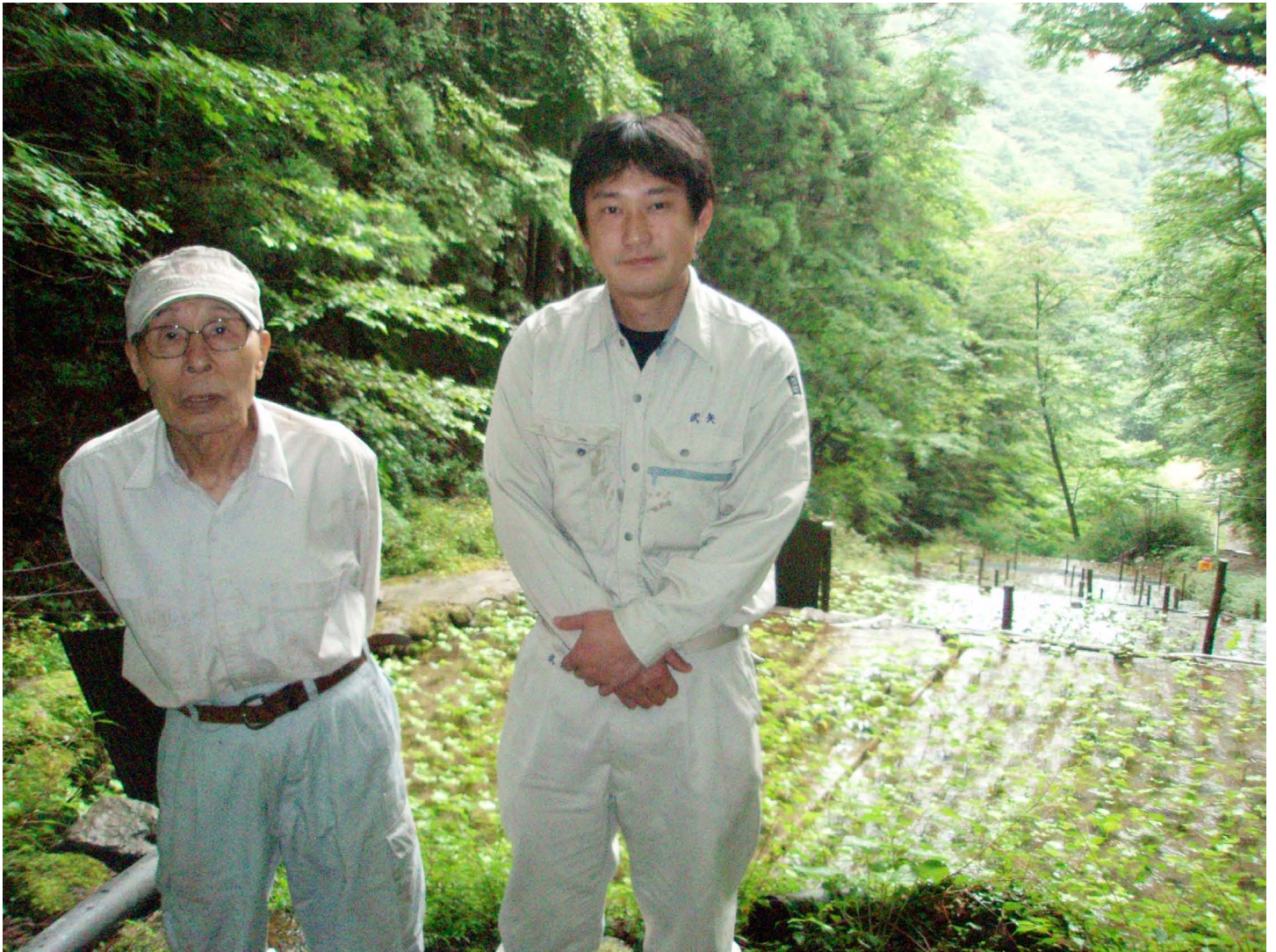
Wasabi growers, Nosegawa, Nara Prefecture, Japan