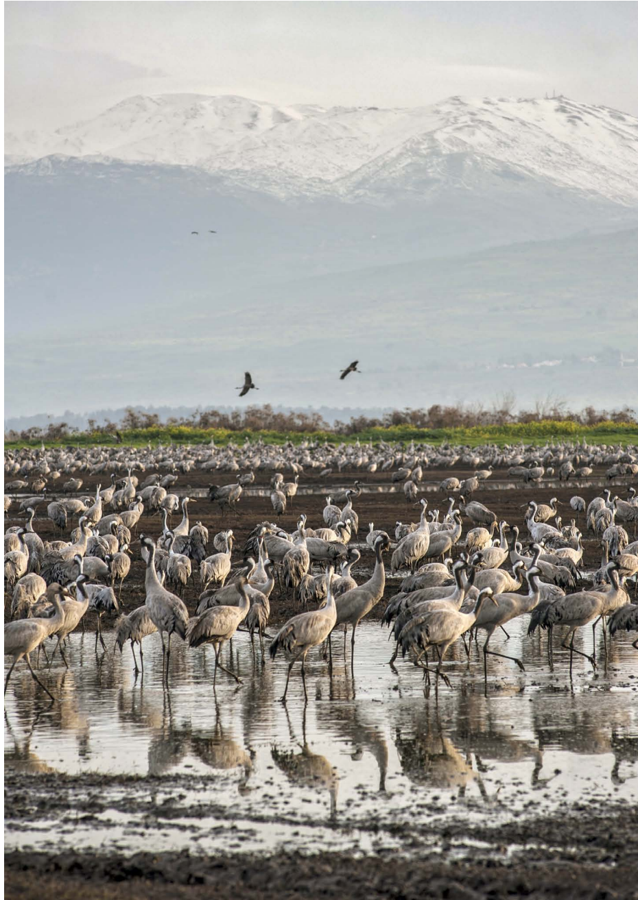
Cranes, Huleh Valley, Israel