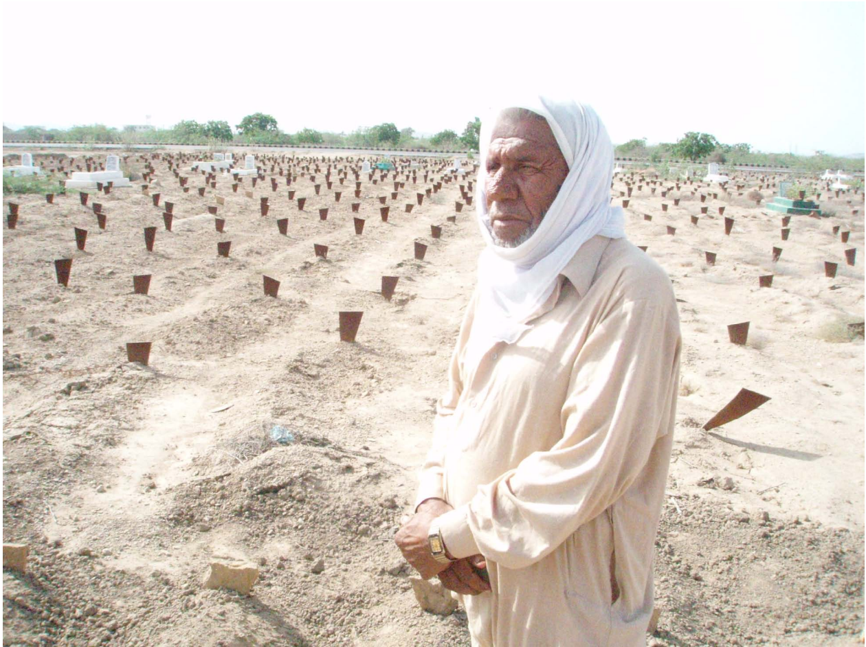
Grave digger, Moach Goth Cemetery, Karachi, Pakistan