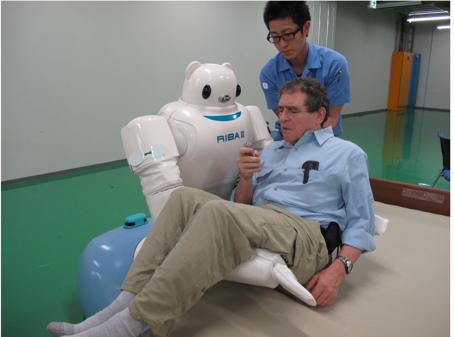
Riba II and author, Nagoya Science Park, Aichi Prefecture, Japan