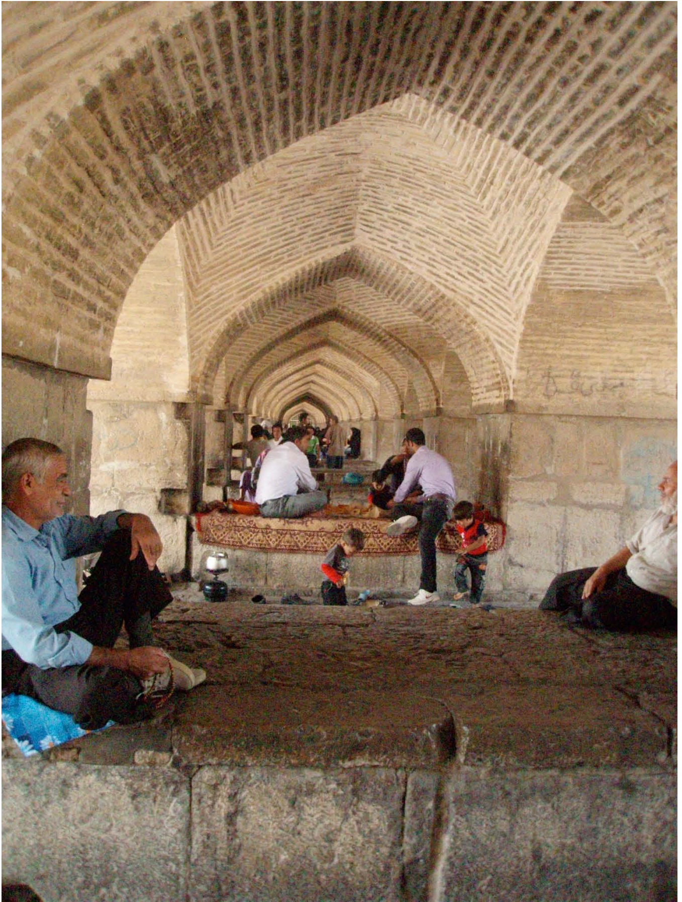
Khaju Bridge, Esfahan, Iran