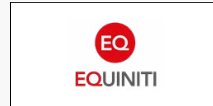
Chief Risk Officer Equiniti