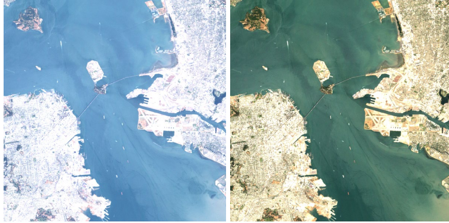
Figure 1-1. Example of LEDAPS Atmospheric Correction: Left, Top of Atmosphere Reflectance Image; Right, Surface Reflectance Image

Figure 1-1 shows a comparison of a TOA Reflectance composite (Bands 3,2,1), and a Surface Reflectance composite image of the San Francisco Bay, using data acquired by Landsat 7 ETM+ (Path 44 Row 34) on July 7, 1999. Both images are linearly scaled from \rho = 0.0 to 0.15.