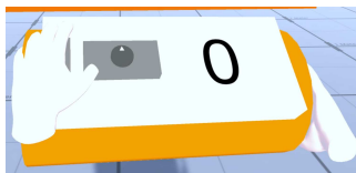
Figure 2: Manipulating code like you would real life objects

Users will be able to grab and manipulate parts of the code, like you would a physical object as shown in figure2. Along with the ability to freely create and destroy these objects. This demonstrates that VR applications can bring tangibility to programming, as well as show some features unique to VR and not achievable by traditional physical approaches.