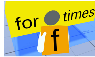
Figure 3: A possible error prevented due to tangible properties

When engaging in programming, users will come across scenes where they commit mistakes, but realise it immediately due to tangible properties given to the code. For example as in figure3, one might accidentally try to set non integers as a loop count in "for" statements. This demonstrates how tangible programming interfaces are less prone to errors, and more friendly to beginners.