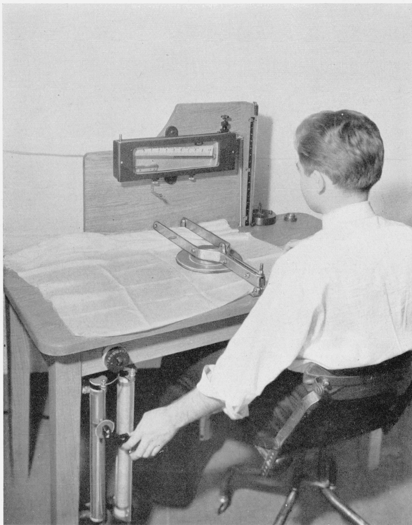
FIGURE 2.— Air-permeability instrument during a test on a fabric.