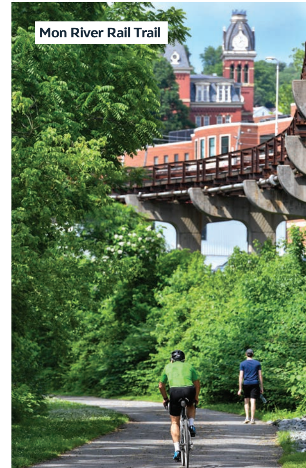
Mon River Rail Trail

Any gift aid (scholarships, fellowships, grants, etc.) received in excess of tuition, fees and required books and supplies, is taxable. Tax forms are mailed annually by the IRS deadline. Need a new tax form or 1098-T for a prior year? See taxservices.wvu.edu for more information.