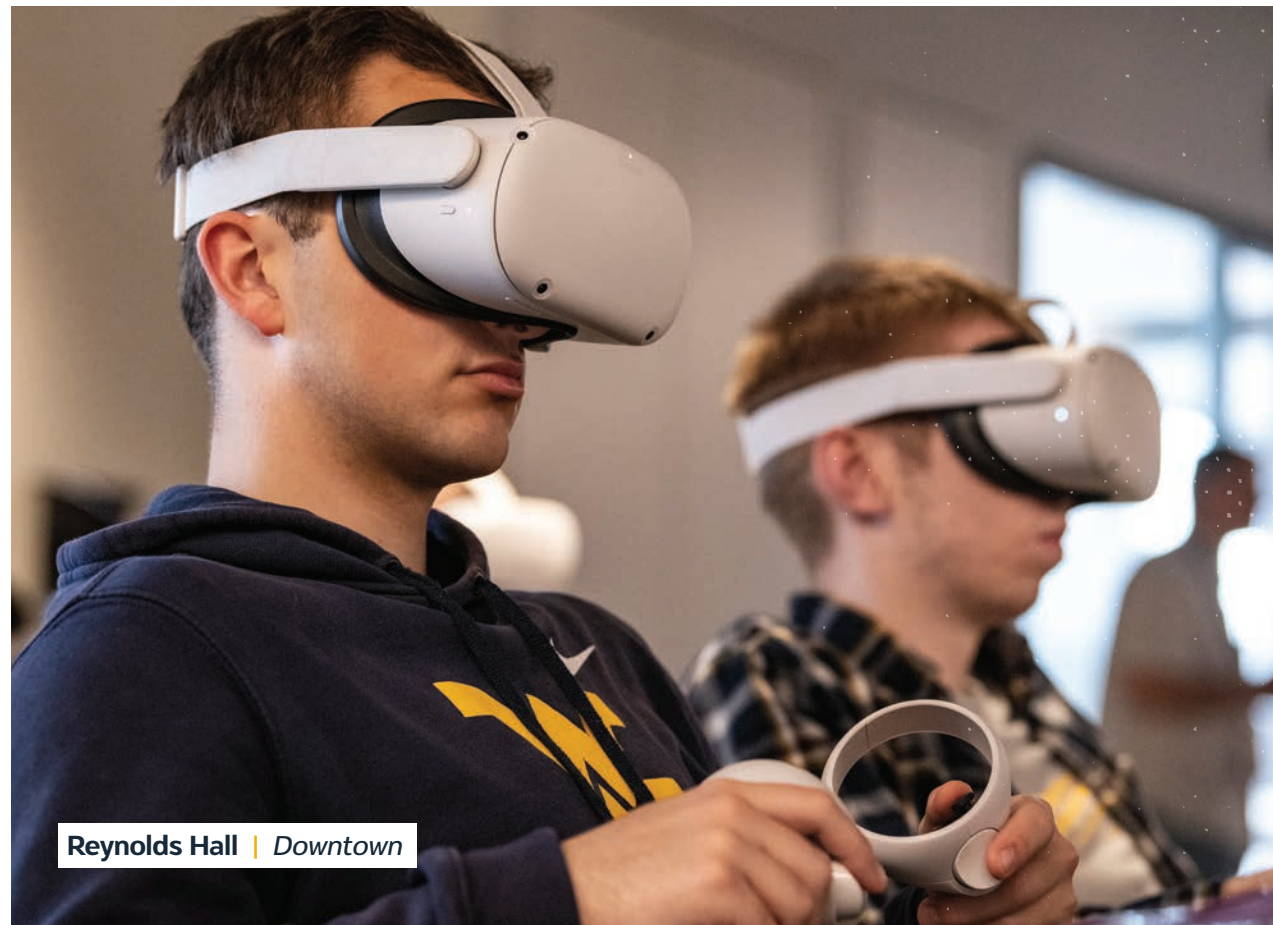
Reynolds Hall | Downtown

Before your student buys a computer, check with their college/school to see if their major has computer and software requirements. Recommended hardware specifications are at it.wvu.edu/services/student-resources , along with directions on setting up their computer in a residence hall, using Wi-Fi, on-campus printing and how students can get free or discounted software .