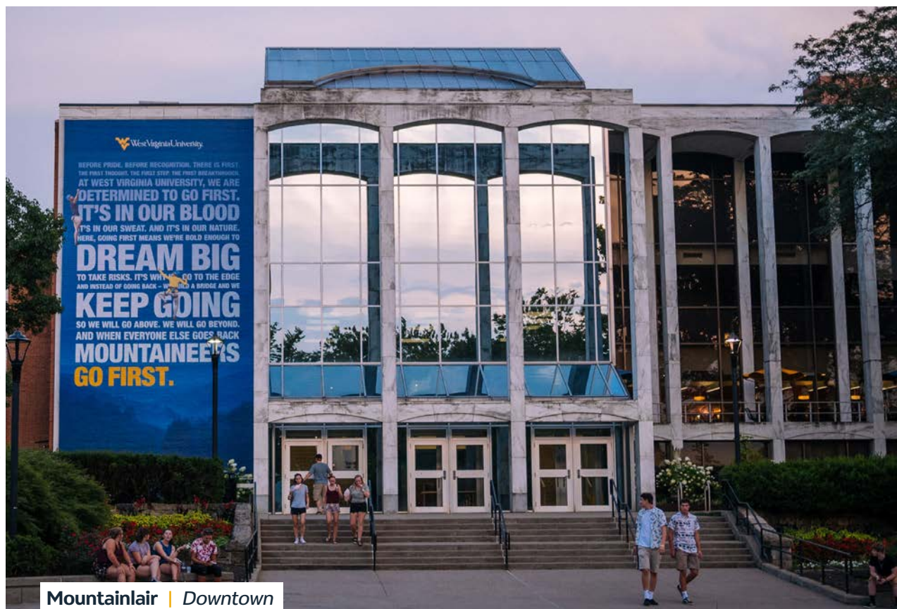
Mountainlair | Downtown

At NSO, you'll meet new people and generate a million new questions. But don't worry. That's what today is all about. And we're here to help.