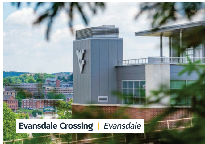
Evansdale Crossing | Evansdale