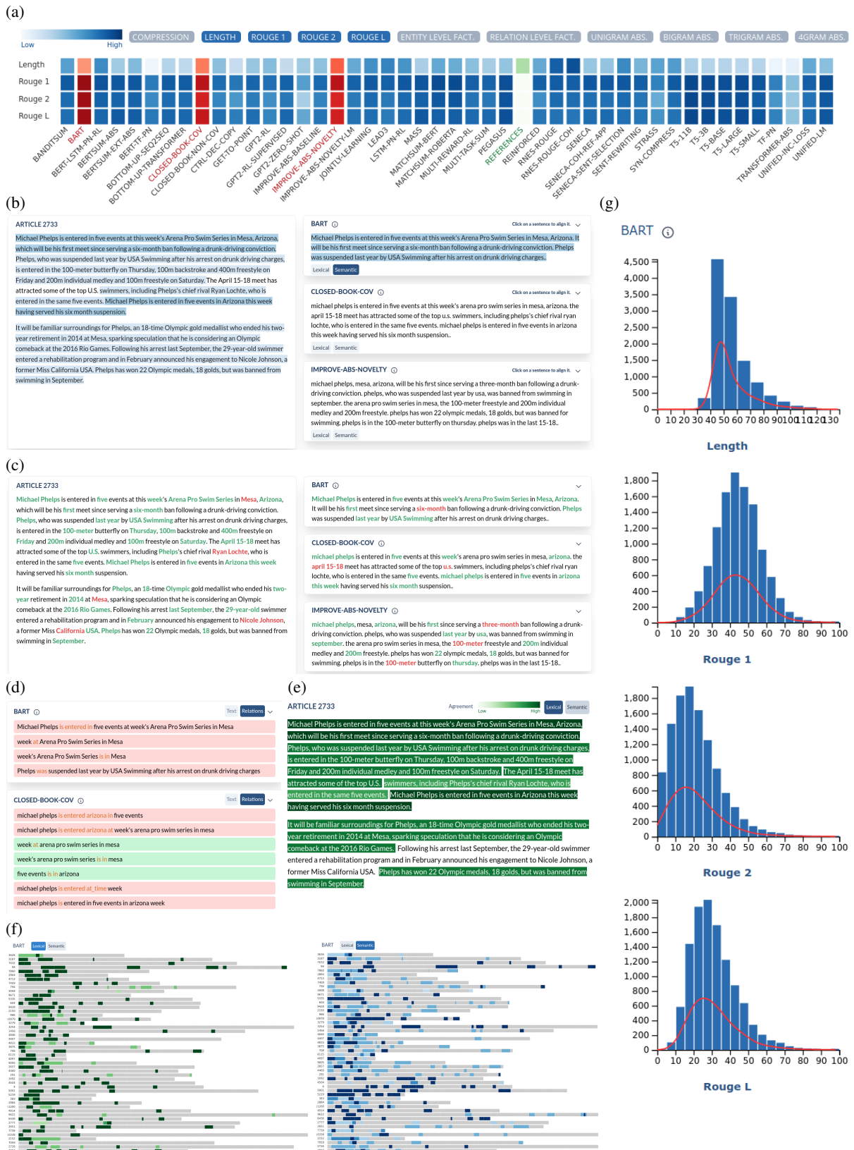
Figure 2: (a) Heatmap overview of 45 models for the CNN/DM corpus; ones selected for analysis are highlighted red. Views for (b) the content coverage, (c) the entity coverage, (d) the relation coverage, (e) the position bias across models for a single document, (f) the position bias of a model across all documents as per lexical and semantic alignment, (g) the distribution of quantitative metric scores for a model.