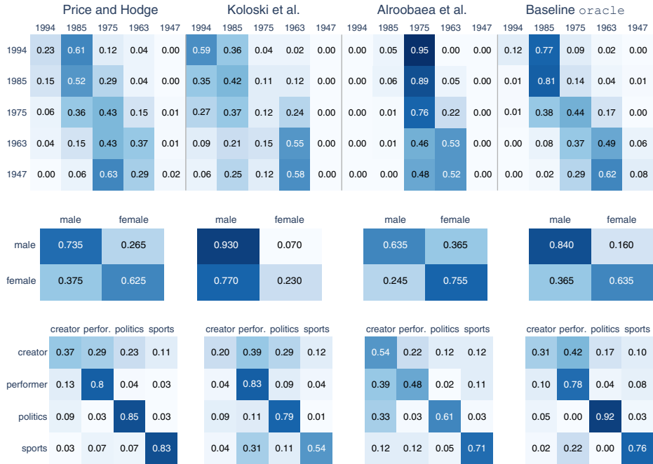
Figure 2. Confusion matrices for the demographics age, gender, and occupation (top to bottom).

of Price and Hodge, still achieve better multi-class F_1 scores and mean absolute errors. Third, all models poorly predict the oldest celebrities born between 1940 and 1955, although, as shown in Figure 1, this class has as many subjects as the 1990–1999 year range while covering a broader age spectrum.