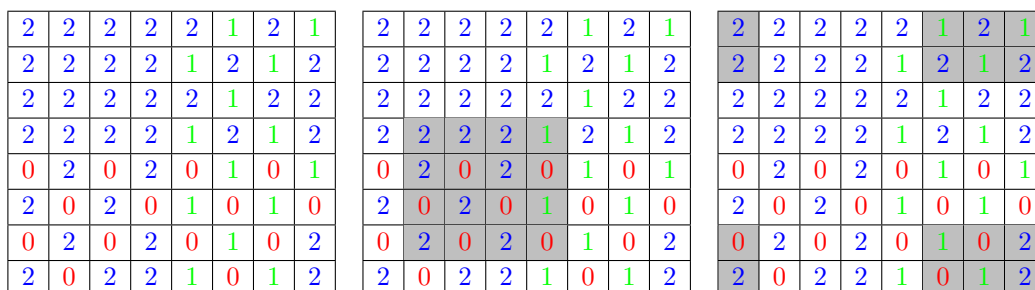
■ Figure 1 A grid coloring of dimension d = 2 , size n = 8 , window size m = 4 . Observe that the two windows depicted contain distinct multisets of colours.

► Example 1. The grid colouring illustrated in Figure 1 has dimension d = 2 , size n = 8 , window size m = 4 , and k = 3 colours (red 0, green 1, and blue 2). No two 4 \times 4 subsquares contain the same multiset of colours. For example, two viewing windows are shown with multisets that have multiplicities for (0, 1, 2) equal to (6, 2, 8) and (3, 5, 8) , respectively. Observe that the second window “wraps around” because the grid is considered as a torus.