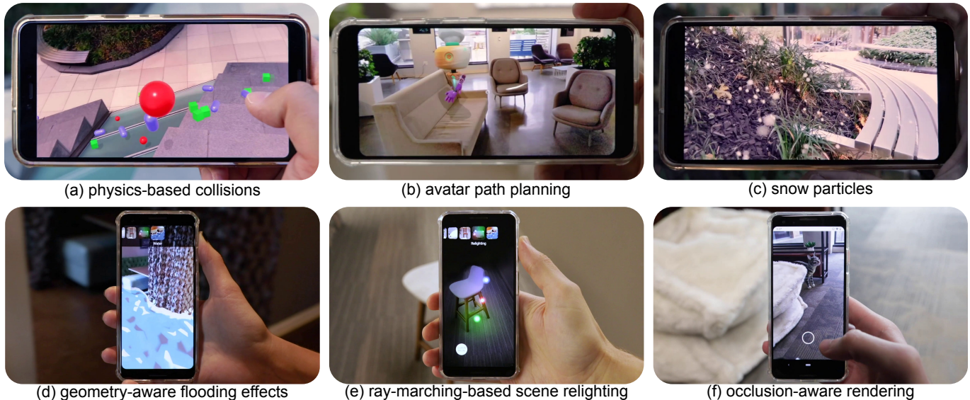
Figure 1. Real-time interactive components enabled by DepthLab: (a) virtual objects colliding with real stairs; (b) virtual avatar path planning and geometry-aware shadows; (c) AR snow effect; (d) virtual flooding effects bounded by physical walls; (e) scene relighting with three virtual point lights; (f) occlusion-aware rendering of a virtual cat behind the real bed. Please refer to the main paper [1] and the accompanying video for more results.