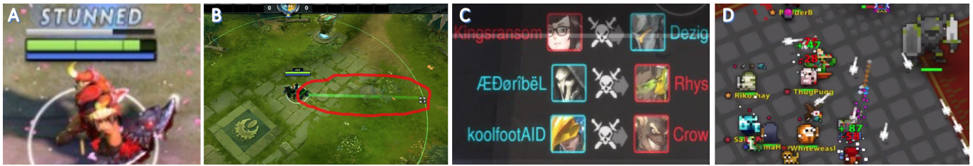
Figure 3. A: “Stun bar” showing when an effect will finish in Dota2 [G23]. B: A visualization of the future range of a spell in Dota2 [G23]. C: “Kill feeds” in Overwatch [G6]. D: Status awareness cues over embodiments in Realm of the Mad God [G24].

views 3 ; and, third, through abstract widgets such as icons on a compass. For example, in PlayerUnknown’s Battlegrounds [G7] players can see map markers for their teammates in a compass at the top of the screen (see Figure 5.C).