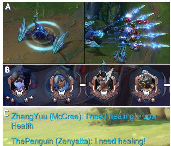
Figure 2. A: Characteristic visual effects of different embodiment actions in LoL [G17]. B: Character icons in Overwatch [G6]: the borders represent player experience while silver icons represent skill. C: Automatically amended chat messages in Overwatch [G6] indicating of the severity of a player’s request.

There is, of course, much that can be conveyed about activity through an embodiment—for example, where an embodiment is (and where they are going) in the gameworld gives strong clues as to a player’s destination and task (particularly in games that are oriented around location-based objectives); similarly, what equipment they are holding (e.g., a sniper rifle) and what they are doing with that equipment (e.g., shooting) clearly shows their current activity. In addition, many games’