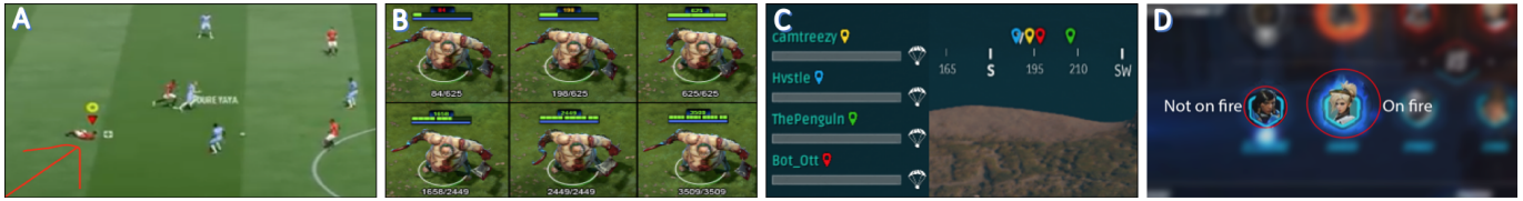
Figure 5. A: Avatar allegiance is shown by the characters clothing color in FIFA 17 [G11]. The arrow is pointing to a diegetic representation of status, low health/injury in this case. B: The dynamic nature of HP bars found in Dota 2 [G23]. C: In PUBG [G7] squad-mate HP bars, activity icons (parachuting) and waypoint colors are shown on the left while the center-top of the players screen shows a compass with the directions of their teammates waypoints. D: Player perception indication in Overwatch [G6] via a on-fire border animation. In this case it shows that the player is performing well.

event [4,5] (e.g., a teammate moving close by is represented by a unique character-specific footstep sound in Overwatch [G6]). Earcons are abstract sounds whose characteristics are varied corresponding to the underlying data they represent, so they can be used to build complex notifications [4, 5]. Learning to identify and make effective use of audio representations is challenging, but useful, for players [34].