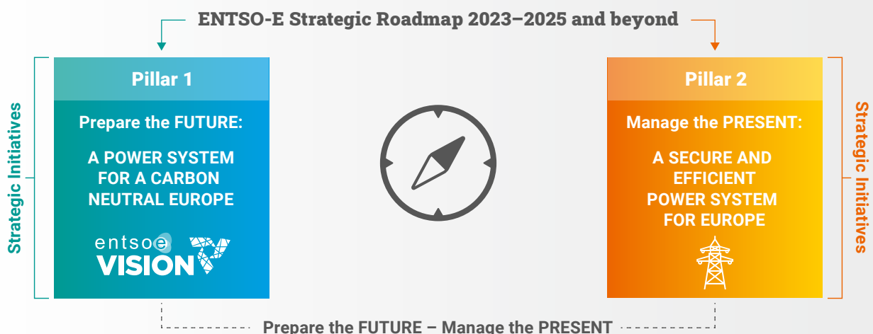
Figure 1: Two Pillars contributing to the ENTSO-E strategic dual objective.

While preparing for carbon neutrality, TSOs will continue to provide a secure and efficient European power system for the whole of Europe. This will require the continuous deployment of operational excellence, implementing efficient and operational market mechanisms, increasing regional coordination, and making the best use of information and communication technologies.