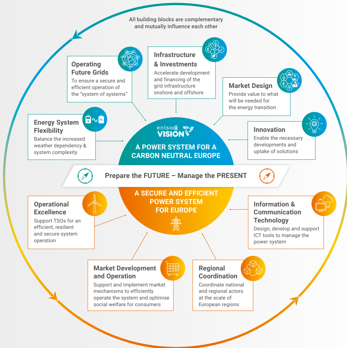
Figure 4: Two intertwined pillars and the building blocks of the Strategic Roadmap

The two pillars A power system for a carbon-neutral Europe and A secure and Efficient Power System for Europe , in addition to their corresponding building blocks, are complementary and mutually influence each other (Figure 4).