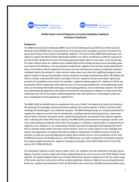
Global Vector Control Response to Invasive An. stephensi