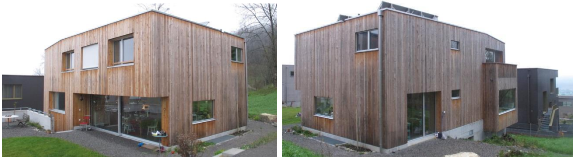
Figure 1: Measurement object is a Minergie-certified standard wood construction in Rickenbach, Switzerland (left hand, south-oriented face; right hand, north-oriented face )

The object of study is a one-family house which was in its final construction phase during the measurement period in October 2013 (Figure 1). The house was completed on the 1 st of July 2014 and is Minergie-certified based on an energy calculation by the energy consultancy Otmar Spescha AG (Schwyz, Switzerland).