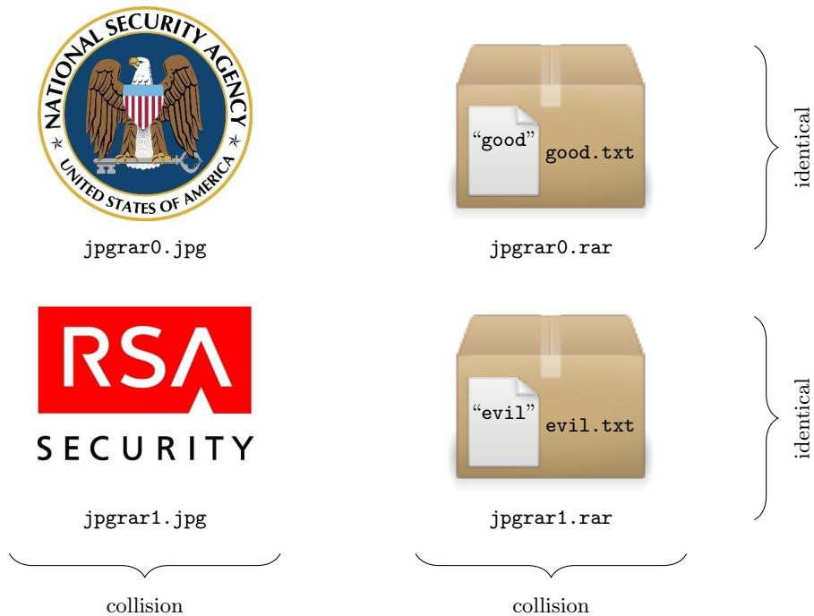
Fig. 2: Colliding JPEG/RAR polyglot file pair for malicious SHA-1 (cf. Table 4).

Now, we can append suitable followup blocks to create valid JPEG or RAR file pairs, both with arbitrary content. As an example, both images in Figure 2 hash to the colliding digest h(m) = 1896b202\ 394b0aae\ 54526cfa\ e72ec5f2\ 42b1837e using the malicious round constants K_1 = 5a827999, K_2 = 4eb9d7f7, K_3 = bad18e2f, K_4 = d79e5877 .