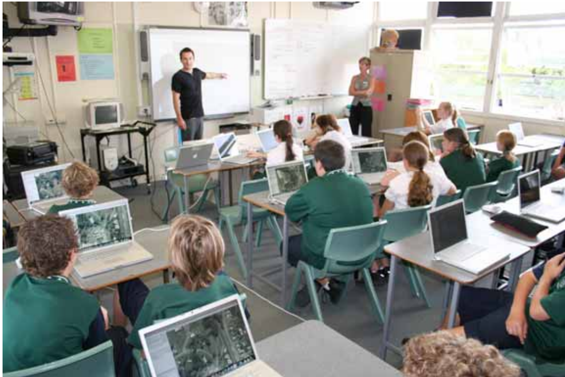
Figure 3: Workshop with Grade 8 high school students

constructed on-the-fly in Second Life . This process was repeated multiple times and not only involved learning how to collaborate within each group, but also how to negotiate space claims and conflicting interests.