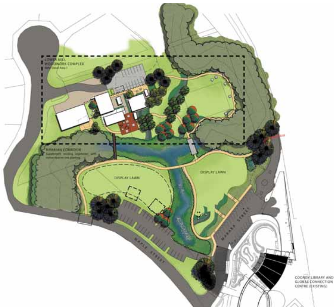
Figure 1: Lower Mill Site, Cooroy

Council is redeveloping a site in Cooroy that was formerly used as a timber mill. The vision for the new site is “to develop and sustain facilities [...] for present and future generations of the community with balanced consideration to history, culture, education, arts and economics.” At this stage, the master plan of the site proposes the development of a new library building, as well as the renovation of heritage-listed buildings that formed part of the timber mill precinct (Fig. 1). The building of a former butter factory, that has been redesigned as a performing arts centre, is also in close proximity to the site and forms part of the overall master plan.