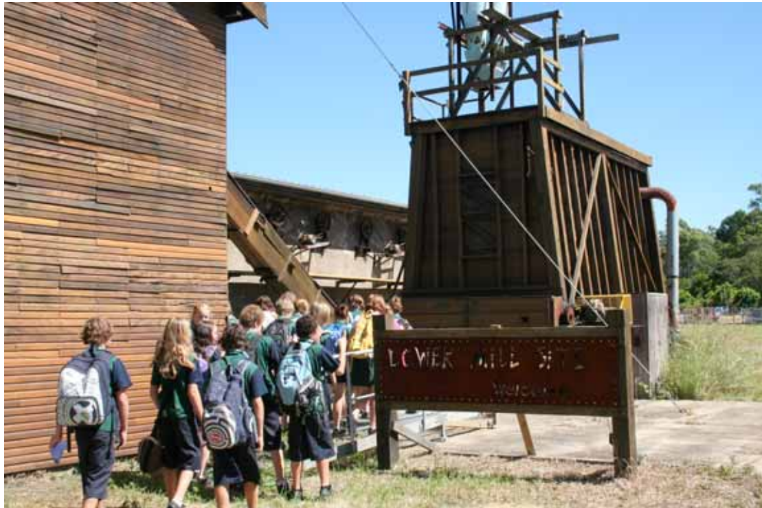
Figure 2: Class excursion inspecting the site in real life

In preparation for the in-class workshop, we re-constructed the site in its current pre-development stage on a stand-alone island using the open source 3D application server OpenSimulator. Although this engine is capable of hosting a wide range of alternative worlds with differing feature sets and multiple protocols, we used OpenSim's compatibility with Second Life in order to allow our users to access the study island from within the Second Life client. So rather than accessing the commercially available world of Second Life (or Teen Second Life ), the OpenSim dedicated server solution hosting our own island helped us overcome security, ethical and duty of care concerns in working with underage students in that the island was only populated by our own users. In addition to information and consent forms to parents, the ability to demonstrate full control over the island was useful in obtaining ethical clearance for this part of our study from the University Human Research Ethics Committee.