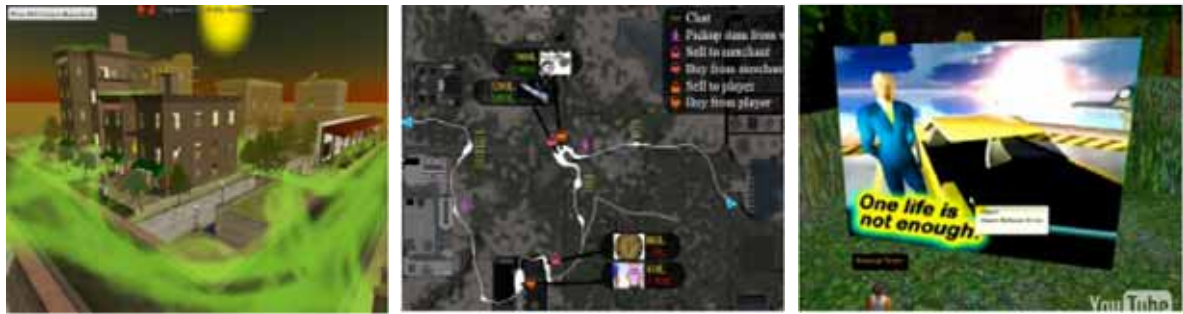
Figure 6: Illustration of three example visualisations of narrative data. On the far left is an in situ visualisation of implicit location events within a VE environment. In the middle is an overhead map visualising explicit business interactions, chat sessions and comments left in the environment. On the right is an example of a video wall embedded in the environment as a form of explicit commentary by users of a VE, being viewed by a planner avatar. (Embedded video example in the rightmost image is drawn from wiki.secondlife.com/wiki/Video_Tutorials , accessed on 29th May 2008.)

visualisations that can be generated from such event data are shown below in Figure 6.