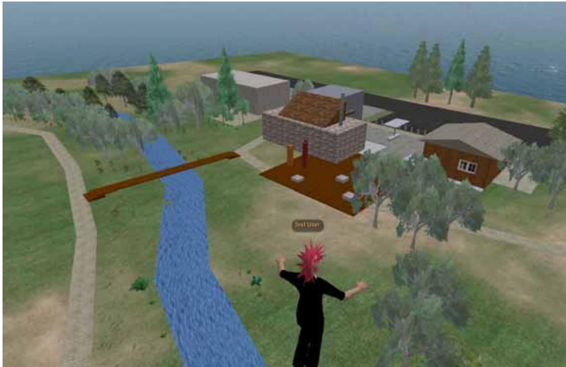
Figure 4: Student ideas are being constructed on-the-fly

features – similar to the addition of new rides that keep the entertainment parks attractive. Second , the students' exposure to their local environment in the virtual world at their fingertips not only brought home some of the wider implications of this particular idea, it also subsequently offered a chance to negotiate space claims. The playground had to be scaled and positioned in a way that would be conducive to other usages such as the library's proposed outdoor reading area, as well as not overlap with potentially conflicting interests, such as the movie screening area. The ability to easily and quickly build objects, scale and move them, enabled the students to lead a discussion that was straight away informed by evidence presented through the results they achieved by manipulating objects within the virtual world.