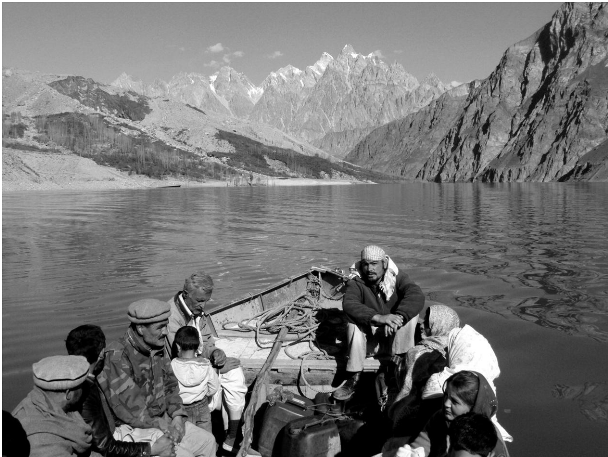
Travelling by boat across the lake.